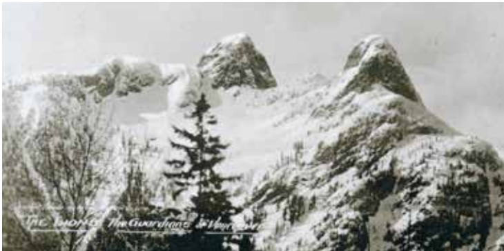
"The Lions: Guardians of Vancouver," photo ca. 1916.

Twin peaks of the Coast Range guard the entrance to Burrard Inlet. Known as "The Lions", the mountains were called Sch'ich'iyúy (or "twin sisters") by the Coast Salish people who have lived in this region for thousands of years. A legend told by Squamish Chief Joe Capilano to E. Pauline Johnson, the famous Mohawk poet, says the sisters were daughters of a Squamish chief. By marrying twin Haida brothers, they brought peace between their warring peoples. After they passed away, the two sisters were immortalized and lifted up to the mountains where they could forever keep watch over their descendants and ensure the peace was kept.