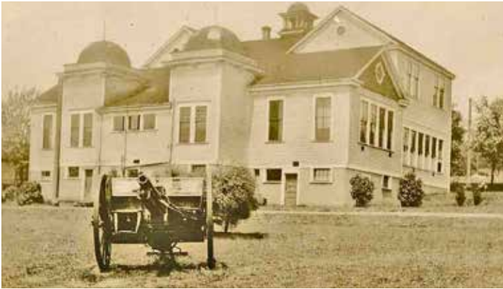
Rear of City Hall, 1922. The Police Department was located at the far-left in 1916-1918.

"A Century Ago" is the first of several planned Express stories about North Vancouver in the years 1916-1918, a time of farms, ranches, wooden sidewalks, lumber mills, shipyards, heroin in drug stores, alcohol prohibition, and World War 1.