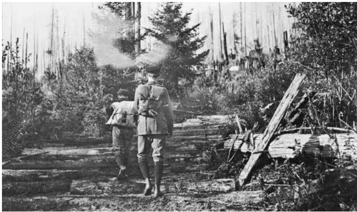
Hikers heading north on the Lonsdale Trail, 1902.

Thousands of hikers climb the “Grouse Grind” to the top of Grouse Mountain. It starts by the north end of Nancy Greene Way. From 1890 to 1910, however, the popular route to the summit was the “Grouse Mountain Trail.” This trail began east of the Grind, near the top of today’s Prospect Road.