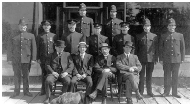
Police officers stand behind seated City officials, June 1915. Shortly after this photo was taken the Department moved into the Central School building.